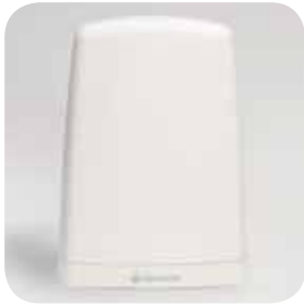
Filter unit with snap-on cover