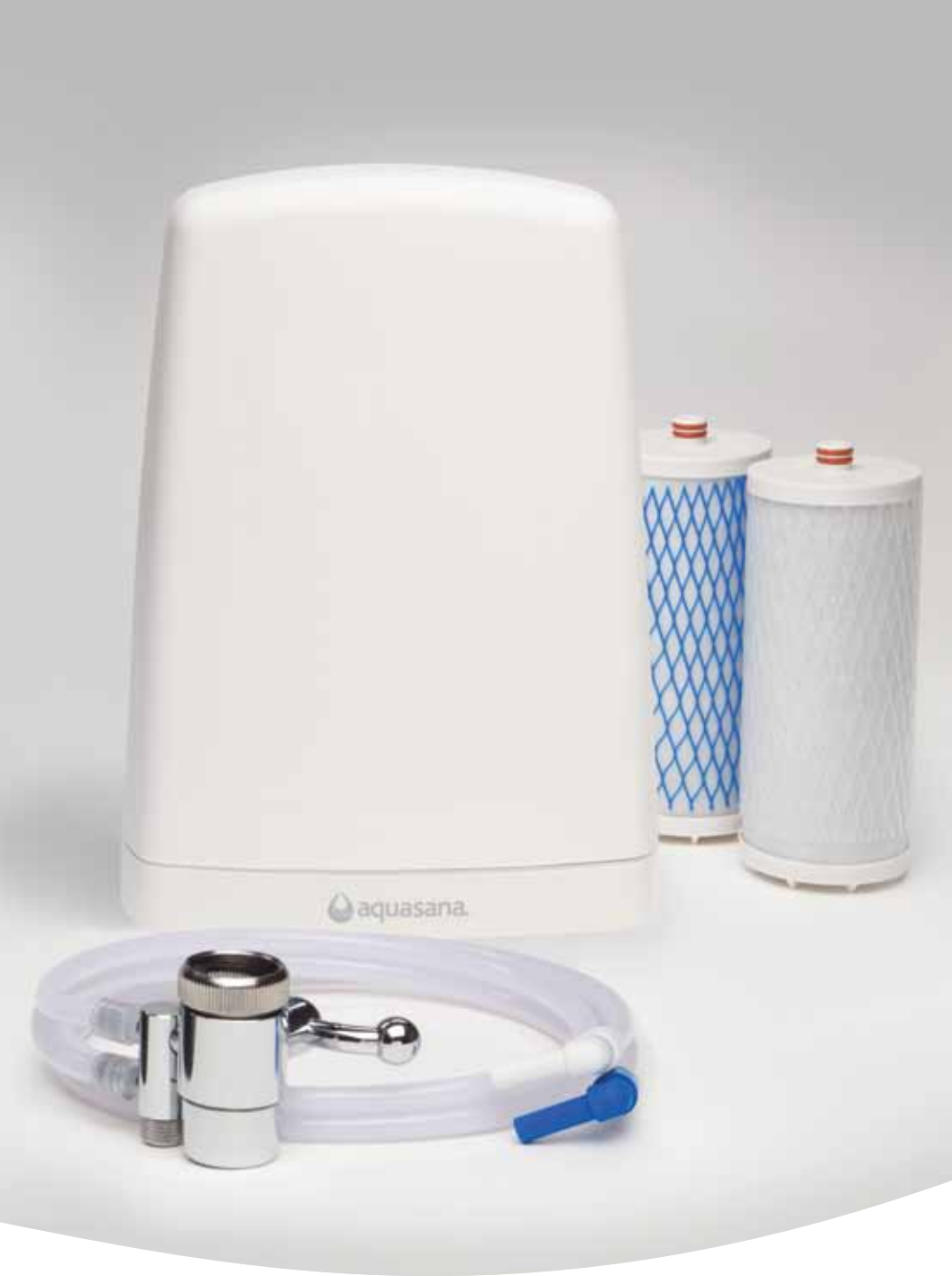
AQ-4000 in White finish with standard diverter valve shown