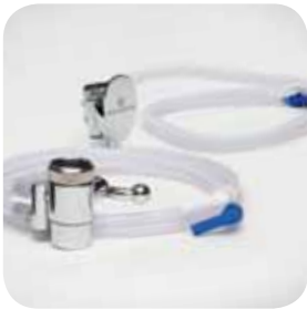
Faucet diverter valve and hose assembly (1 included, either Standard or Premium)