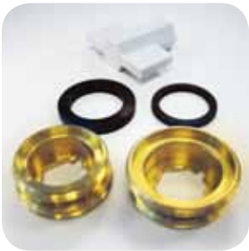
Brass faucet adapters (2 sizes), rubber washers* and install tool (not included in or covered by the system certification)