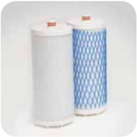
Filter cartridges (A & B) pre-installed in filter unit (Model no. AQ-4035)