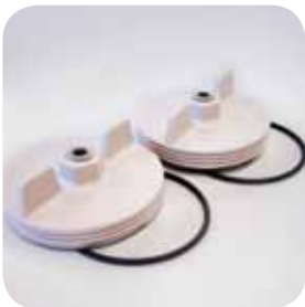
Threaded cartridge caps (A & B) and "O" rings pre-installed in filter unit